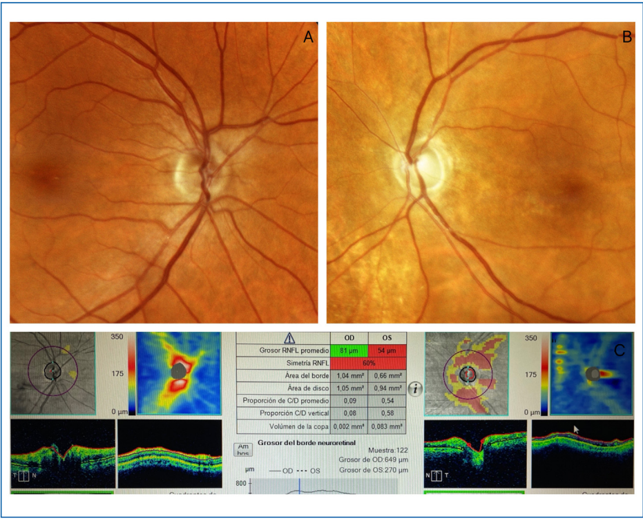
Figure 1. A. Fundus photography of both eyes, showing a marked pallor of the optic nerve head of the left eye and unremarkable findings in the right eye. B. Optical coherence tomography (OCT) scan depicting a reduction of the peripapillary retinal nerve fiber layer thickness in the left eye. C. Visual field of the left eye performed by Octopus campimetry showing a significant temporal visual field defect.