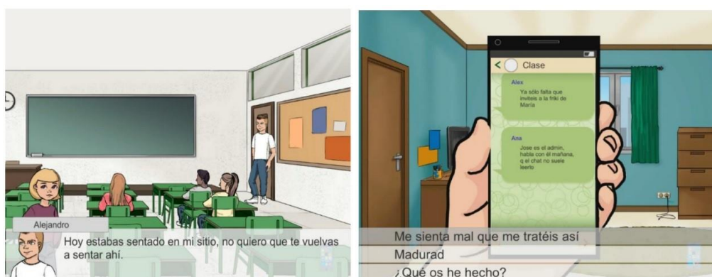
Figure 1. Screenshots of Conectado depicting the classroom scenario and the home use of the in-game mobile classmates social chat.

The plot of the story occurs during 5 days in which the players move from home to school and back home, in the usual places where cyberbullying occurs (Figure 1). Empathy and other emotions are brought to players through mini-games presented as nightmares at the end of each day. Dialogues with other in-game characters also raise players' emotions, as the schoolmates slowly turn against the main character.