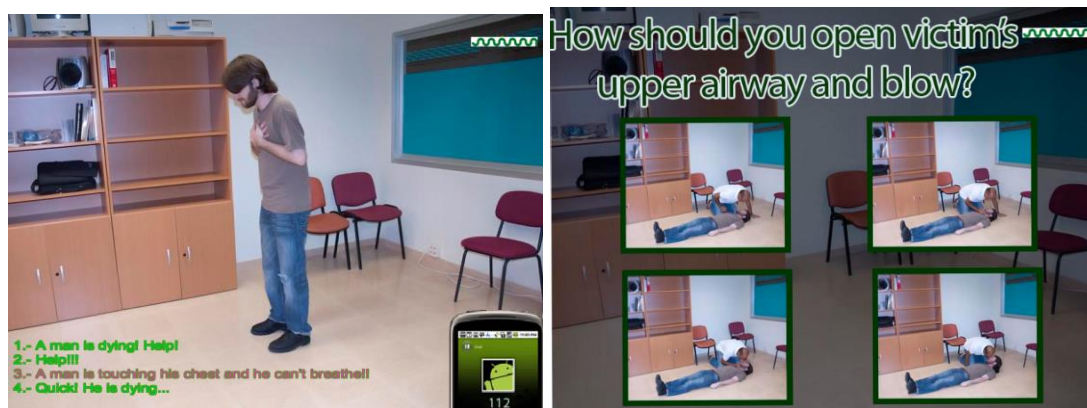
Figure 6. Screenshots of First Aid Game depicting a conversation with the user and an in-game selection using pictures.

The game was validated in a usual pre-post experiment with a control group in 2011 with more than 300 students in four secondary schools of Aragon (Spain), as described in (Marchiori et al., 2012). Results showed that, although slightly lower than in the control group (that took part in a theoretical and practical demonstration of the maneuvers by an accredited instructor), the increase in the results from the learning experience was significant in the experimental group which played the game.