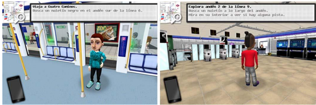
Figure 4. Screenshots of DownTown depicting the user avatar in a Metro wagon and in a hall before using the ticket.

years old with Intellectual Disabilities (ID) such as Down Syndrome, mild cognitive disability or certain types of Autism Spectrum Disorder (ASD). The game aims to train them in using the public subway transportation system of Madrid (Spain), following the positive results of other game-learning experiences with ID users (Kwon & Lee, 2016).