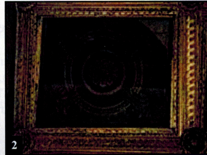
Fig. 2 – The painting on coffered ceiling in the Church of Arcos de Valdevez – side-chapel of Our Lady of Sorrows, Viana do Castelo. The original painting on wood is under canvas picture.