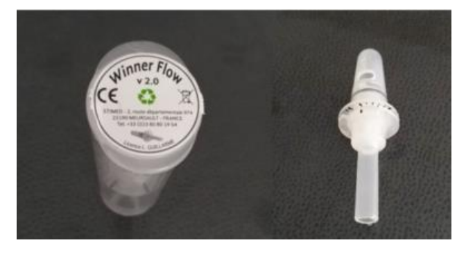
Figure 1. Expiratory Flow Control Device (EFCD) (Winner Flow, v2.0).

The abdominal drawing-in maneuver (ADIM) is frequently used to facilitate the activation of the TrA [3,4], employing the lower part of the abdominal wall, drawing the belly button towards the back [9], being effective in lumbopelvic stabilization programs [10], strengthening programs [11,12], improving pulmonary function [13], and in the reduction of lumbar pain symptoms [14]. Due to the difficulty of the ADIM execution, several authors have explored the TrA muscle activation using the expiratory muscle recruitment and finding benefits with respect to the execution of an ADIM, in the increase of the thickness of the TrA when performing maximal expiration [13–15]. To guide this expiratory flow, an exsufflation nozzle was developed and tested in urinary incontinence [16], an instrument for performing active expiration through an 8-mm tube, which maintains the glottis open. The expiratory flow control device (EFCD)—Winner Flow® version. 2.0 (Prim Fisioterapia y Rehabilitación, Madrid, Spain) (Figure 1)—is an evolution of this first model [16], and was developed to redirect pressure, and based on abdominal-perineal synergy and the expiratory function of the TrA, an adjustable increase in expiratory flow may be generated [17].