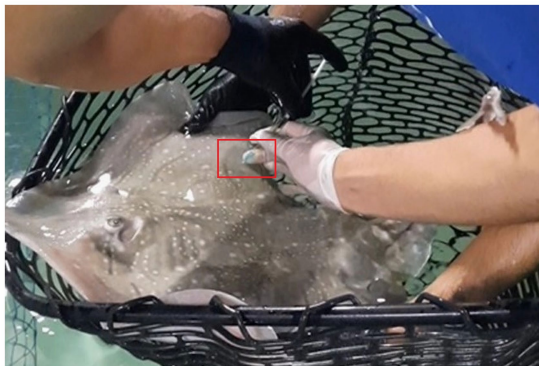
FIGURE 1 Injection site (pectoral fin musculature) utilized for the intramuscular (IM) administration of voriconazole in undulate skate ( R. undulata ) during this study (red square). Please observe that the animal is manually restrained dorsoventrally during the drug administration process. Quarantine facilities, Oceanogràfic of Valencia, Spain.

To ensure that dosing regimes are safe, pharmacological studies should ensure safety, both in terms of drug dosage and potential side effects, as well as possible adverse effects caused by the experimental procedure. The evaluation of skate behavior in this study was conducted by veterinarians and the responsible aquarist, who were familiar with the pretreatment behavior of the animals and visually observed the animals during and after sampling.