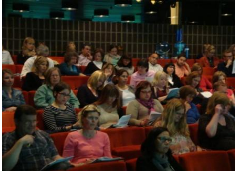
Dissemination lecture at Stockholm international meeting