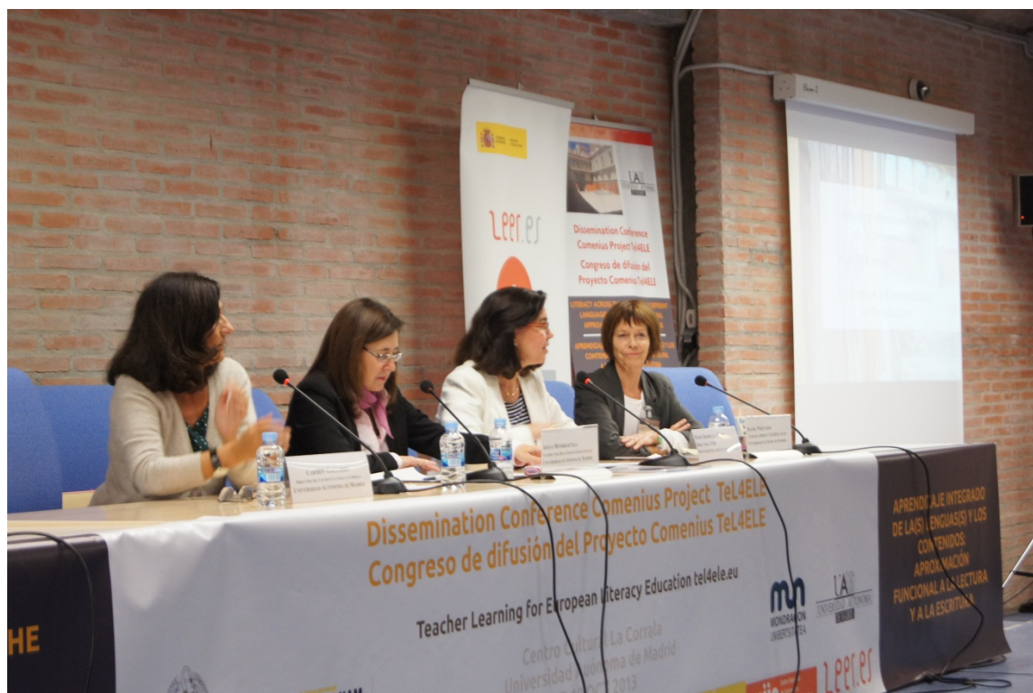
Dissemination conference in Madrid, Oct 17-19, 2013.

Three quarters of the key educators expressed an interest in carrying out further research and more than half the key teachers gave 'doing further research into the approach' as a reason for continuing with the R2L program. Beyond the immediate group a postgraduate researcher is planning to look into the uptake and sustainability of some of the aims of the R2L project over the long term as part of a PhD with Nottingham University.