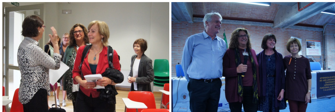
Dissemination conference in Madrid, Oct 17-19, 2013.

The keynote presentations were streamed and can now be watched at http://www.youtube.com/results?search_query=tel4ele+madrid&sm=12 .