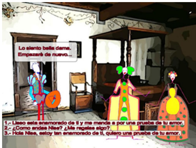
Fig. 1. Screen capture of the game.

has strong underlying narrative underpinnings [18]. Second, graphical adventures are similar to theater plays [19]. Third, it aligns well with learning scenarios where problem-solving and critical and deductive reasoning are important [20]. Last, adventure games have the ability to engage students through an appealing story by creating empathy with characters [21].