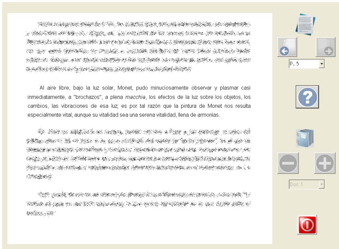
Figure 2. Screenshot of Read&Answer software: only one paragraph is visible at a time.