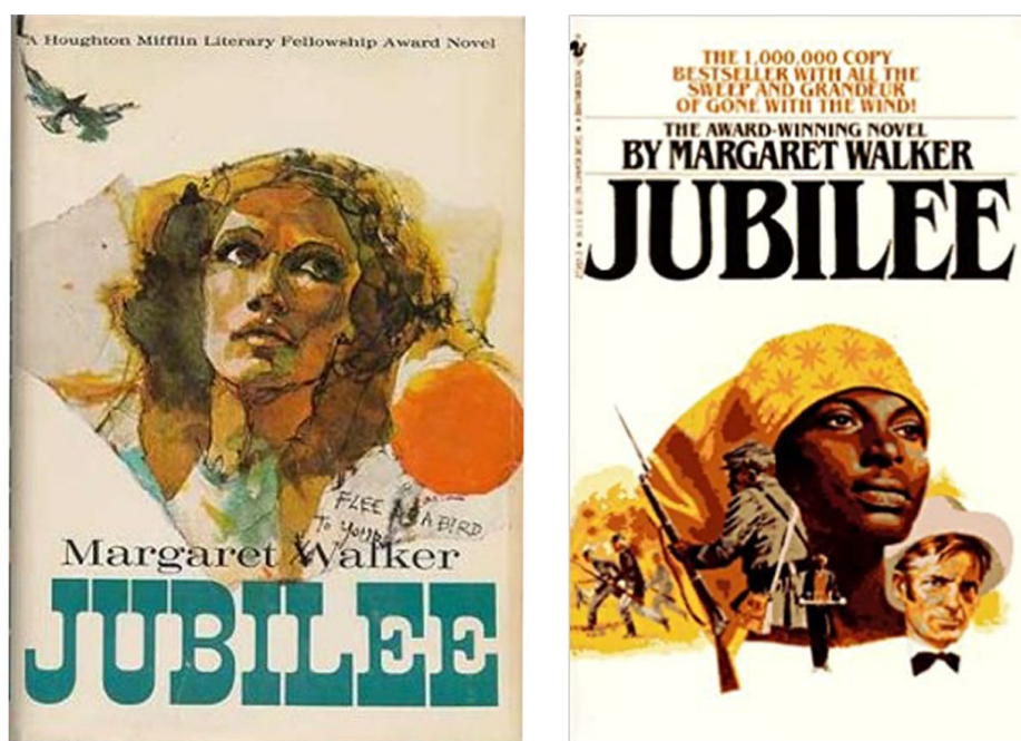
Figure 1. Covers of Jubilee 's editions (1966 and 1984)