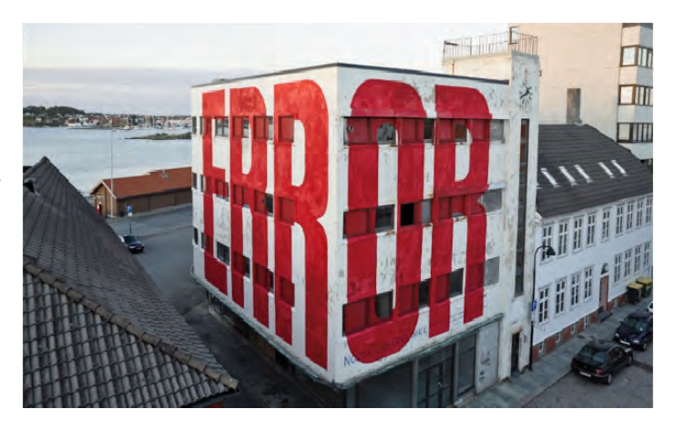
Figure 1. From the Madrid-born Artist SpY, Painting in Stavanger (Norway) (http://spy-urbanart.com).

Artivism coincides with the most extensive and complex institutional and political crisis in the whole world, in which disenchantment and the dissolution of political symbolism (Dayan, 1998) have led to a lack of faith in traditional political processes.