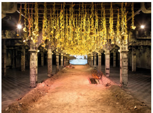
Figure 8. Basurama (https://bit.ly/2JXExDt).

Artistic literacy has to do with the ability of art to reestablish and channel human expression. As Abarca (2016: 8) indicates, "a work of urban art allows the viewer to measure the physical dimension of the environment by projecting its own physical dimension on it". The creative environ-