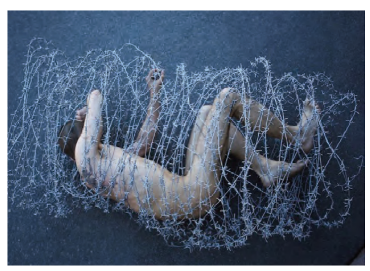
Figure 2. "Carcass" by Pier Pavlensky. Performance in Moscow (2008).

The language of artivism often implies the use of the artist's subject as a means for the disruption of abstraction, or to avoid the loss of representative capacity, and to recover individual freedom of expression. According to Kombarov, the total sub-