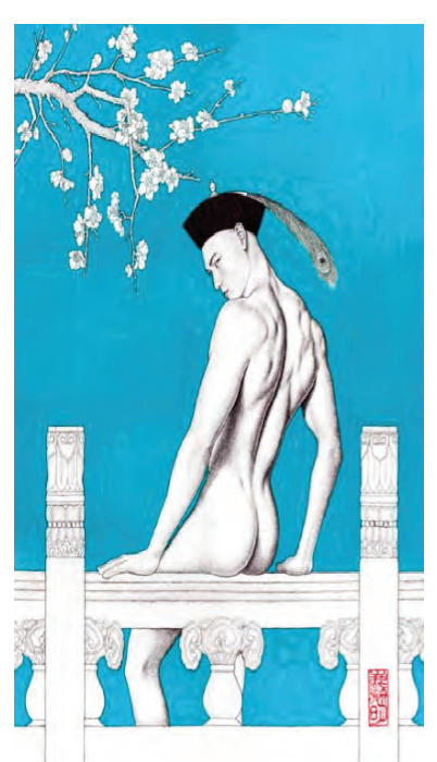
Figure 6. "Calendar" Work of the Chinese artivist Musk Ming (www.muskming.com).

A similar Spanish example is that of the collective Basurama, founded in 2001, which is an example of activist creativity that has centered its area of study and action on production processes and the generation of waste involved. The "Agostamiento Project" was a site-specific contribution to the "Abierto x Obras program" that took place in the old cold storage room of the Slaughterhouse in Madrid. The collective proposed an interior landscape created by planting 7,000 sunflowers that had been cultivated next to the inhabitants of the "Gran Vía del Sureste",