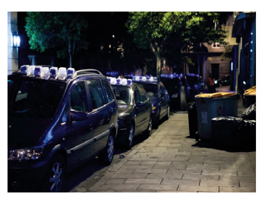
Figure 7. Luzinterruptus (https://bit.ly/1w4GZPw).

absence of freedom, the "writing-centrism", the mastery of theoretical knowledge, students in a passive and receptive position, and rigidity in positions and academic roles (Aguaded, 2005: 30). Instead, in the "educommunication" leading up to the halfway point of the XXI century, the approaches to education proposed by authors such as Paulo Freire and Mario Kaplún rule, in which not only communication and education are seen in intimate relation, but with a liberating purpose of global civic education (Middaugh & Kahne, 2013; Pegurer-Caprino & Martínez-Cerdá, 2016). In the processes in which educommunication advances towards constituting a liberating element and a generator of active communities capable of empowering themselves, artivism can provide all the necessary elements to re-signify teaching and