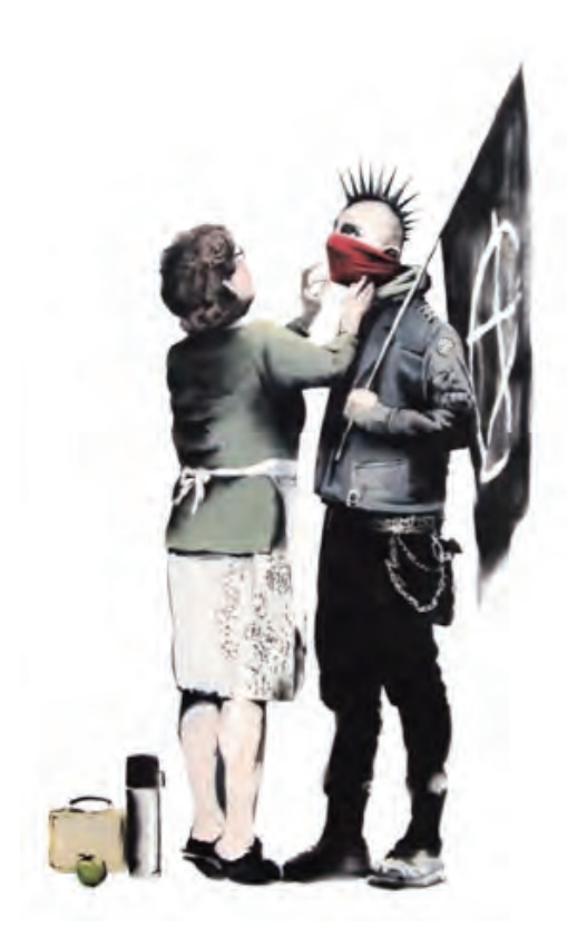
Figure 4. Banksy. Artist's website (www.banksy.co.uk).

Artivism is a current language of independence and freedom. In our research activities, we have recorded hundreds of artivism experiences around the globe. We will now highlight some essential prototypes from our archive to study their cases. A clear example is Banksy, graffiti artist, political activist and unidentified film director, who carries out his work from Bristol in the United Kingdom anonymously. The artist defines graffiti as the revenge of the lower class or guerrilla that allows an individual to wrestle power, territory, and glory, in front of a larger and better-equipped enemy. Banksy's works have addressed various political and social issues, including anti-war, anti-consumerism, and anti-fascism.