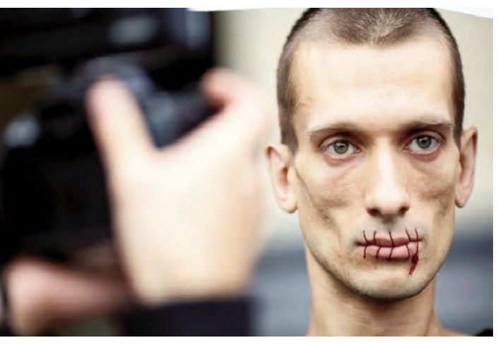
Figure 3. Pavlensky, Performance "Stitch" (Courtesy of Vyacheslav Kombarov).

In this performance by Pavlensky, the Russian artist sewed his mouth to make a photo session in the Red Square in Moscow, expressing not only political content but an entirely new language. What we see in this artivist is the reestablishment of the power of the body to transmit the desire for freedom. The repressive act is denounced here with beauty, integrity, and clarity. As Lethaby (2017), of the British Arts and Crafts movement, said in the XIX century, preceding artivism, "art is liberated humanity, and everything else is slavery".