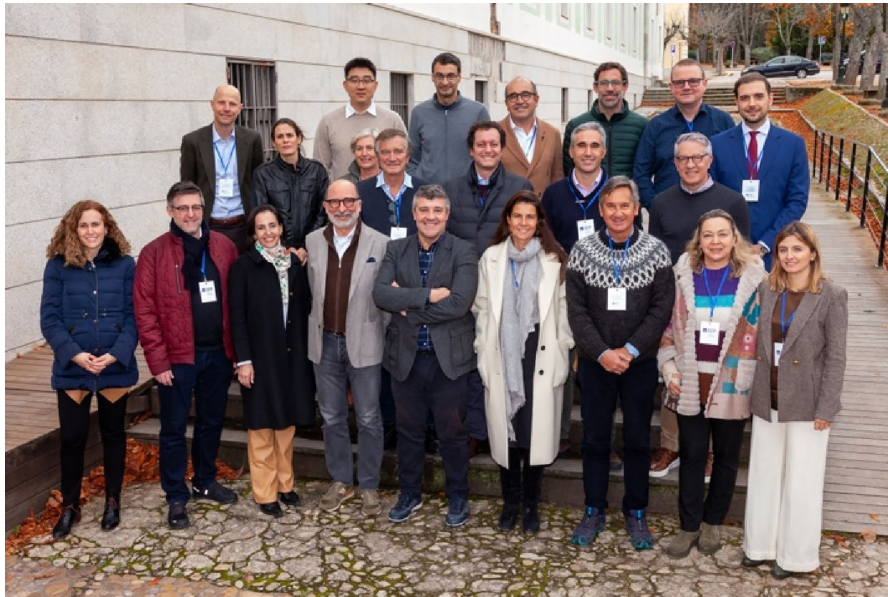
FIGURE 4 | Workshop participants in Working Group 3.

definition of periodontitis', which requires that the CEJ is visible, or that the tip of the periodontal probe identifies the root surface below the CEJ.