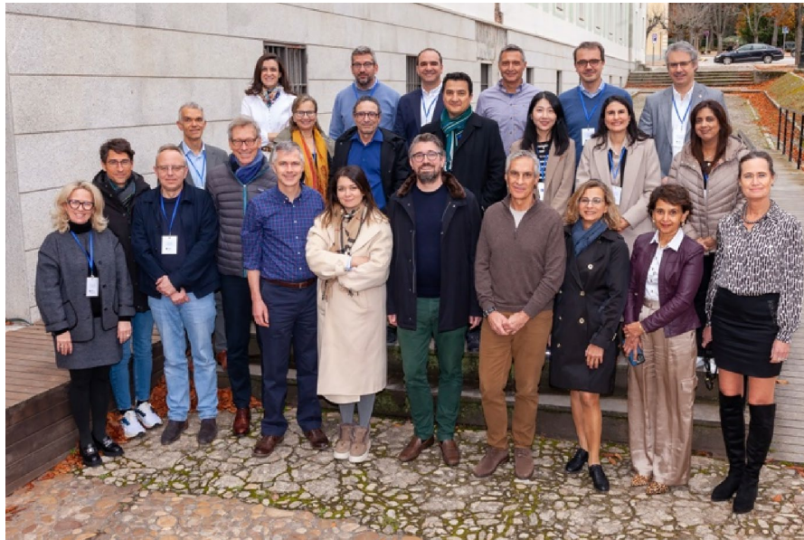
FIGURE 3 | Workshop participants in Working Group 2.