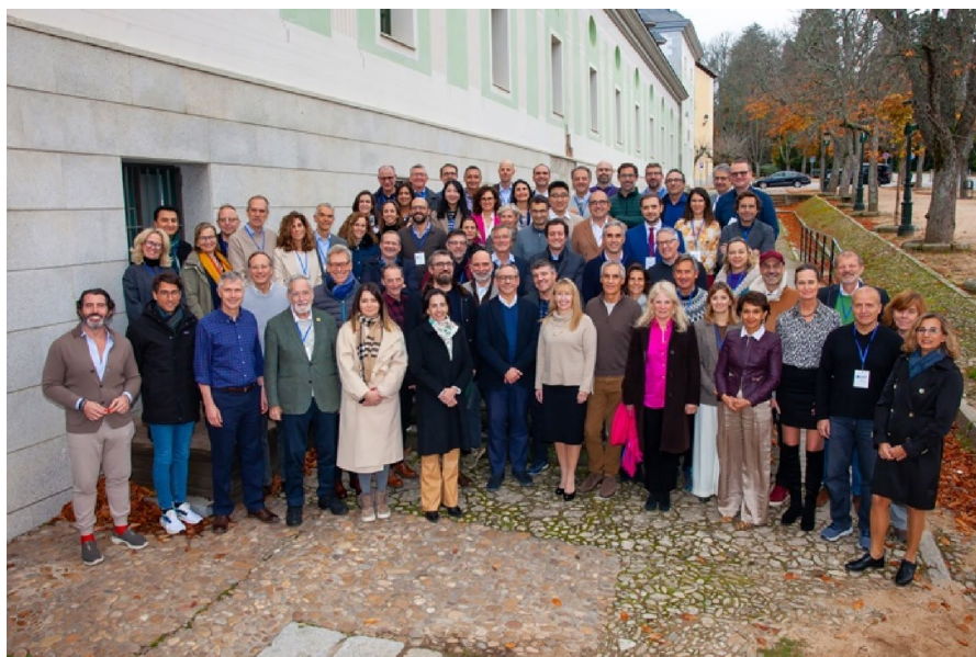
FIGURE 1 | Workshop participants during the in-person meeting in La Granja de San Ildefonso, Segovia, Spain.