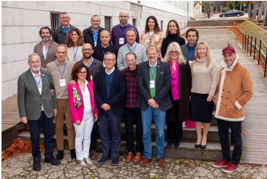
FIGURE 2 | Workshop participants in Working Group 1.

Conditions (Caton et al. 2018). These definitions consist of periodontal health (Lang and Bartold 2018), dental biofilm-induced gingivitis (Chapple et al. 2018) and periodontitis (Papapanou et al. 2018; Tonetti et al. 2018), and are based on detecting clinical attachment loss (CAL) and specific thresholds of inflammation: