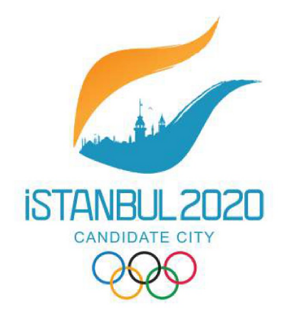
Figure 2: Istanbul's Olympic bid logo for the 2020 Olympics showing the distinct skyline of the old city (Hurriyet Daily News 2013).

In the 1990s, following Turkey's EU rejection and a newfound distrust of the West as a result of the destructive economic effects of the Gulf War, Turkey faced a time of turmoil. Atakuman (2010) states, 'Turkey began looking for independent means by which to construct and protect its sovereignty while presenting the appearance of a regional superpower that Europe should seek to embrace' (118). Atakuman continues, 'new metaphors were created within the heritage discourse to glorify' Turkey (118). In the case of Hagia Sophia, Ataturk, 'used the policy of secularism to cast the building less as a palimpsest of religious practices than as one of cultural histories, where Byzantine and Ottoman legacies were to be shown side by side and equally defunct' (Shaw 2002: 932). 'To make Hagia Sophia a museum meant that it would be unlived. That was part of the idea' states leading scholar and conservator of Hagia Sophia, Zeynep Ahunbay (interview, 26 March 2013). Today a focus is placed on the architecture of the building to demonstrate the relationship between the 'east- west'.