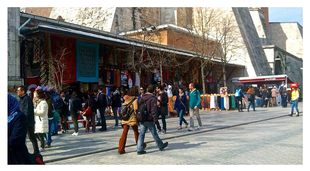
Figure 3: Southeast wall of Hagia Sophia where both tourist shops as well as the Ayasofya Mosque are located.

former director Haluk Dursun, during the Ottoman times this was an annex building for the Sultans (interview, 29 March 2013). He continues, 'the building is a problem', not only does it not belong historically as there should not be a mosque within a mosque, but '[it] doesn't belong to the church [referring to the historical function of Hagia Sophia], [it] doesn't belong to the museum' (interview, 29 March 2013). Despite this however, the mosque uses the minarets of Hagia Sophia for the call to prayer. Audible from the loudspeakers affixed to the south and west minarets, the call to prayer can be heard from Hagia Sophia during the five prayer times as the verses alternate with that of the Blue Mosque. Despite the building functioning as a secular museum, the call to prayer continues to be recited from the Hagia Sophia minarets. On the opposite end of the southeast wall from the Ayasofya mosque, are located multiple shops selling various types of items from clothing, to rugs, to postcards (Figure 2).