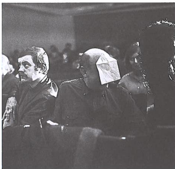
Fig. 18 Audience member performing Juan Hidalgo's el sobre verde , 5 October 1966