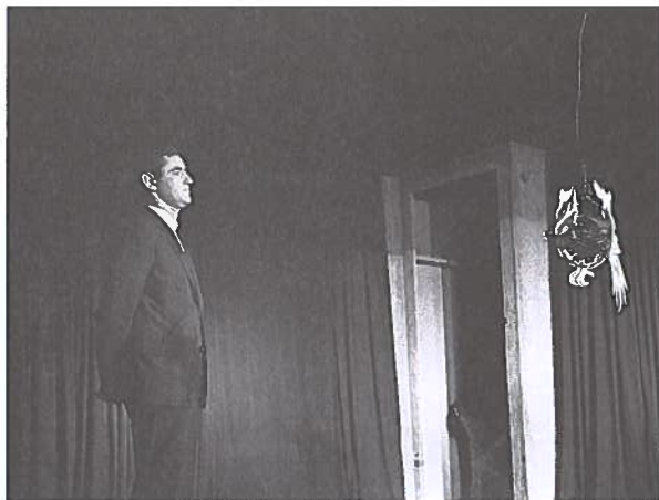
Fig. 11 Tomás Marco performing his Homenaje a Strawinsky (El pájaro de fuego) , 5 October 1966