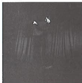
Fig. 17 Juan Hidalgo performing his EL RECORRIDO JAPONÉS , 5 October 1966