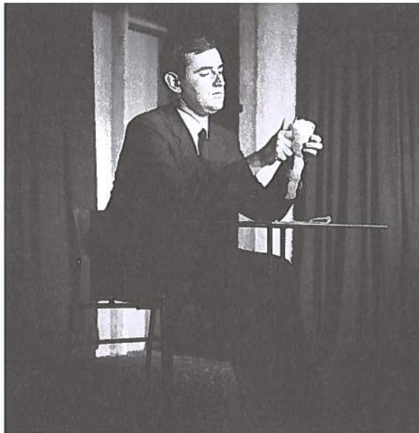
Fig. 10 Tomás Marco performing his Homenaje a Rossini (Guillermo Tell) , 5 October 1966