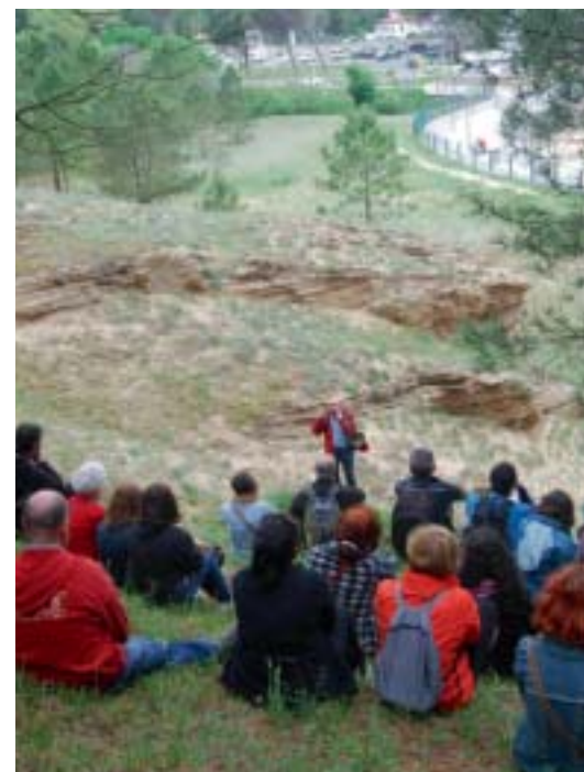
Above top: Geolodía 15. ark Above lower: Geolodía 15. Left: Geolodía 15.