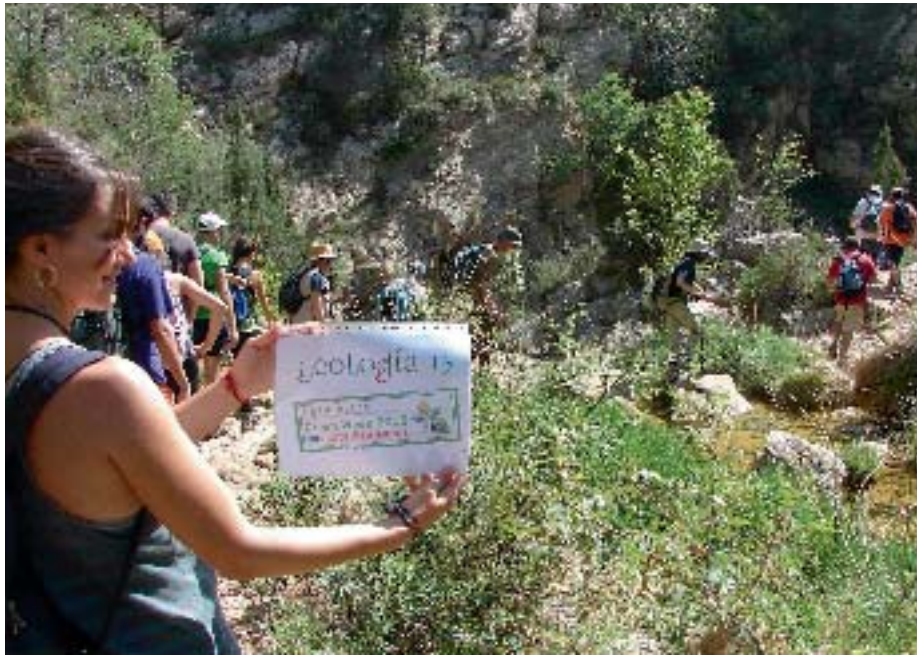
Right: Geología15. Castellón