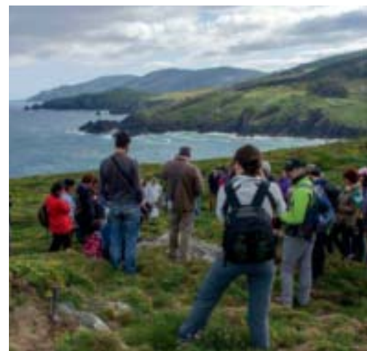
Geología15. A Coruña more cloudy weather in the Galicia

We hope also to widen this initiative into neighboring countries. At present, Andorra has joined the initiative and we hope more countries will follow. u