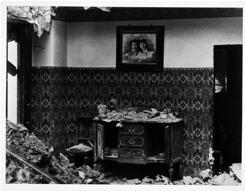
Figure 11. Gerda Taro and Robert Capa, Madrid, Winter 1936–1937 , Museo Nacional Centro de Arte Reina Sofía, 1936–1937, International Center of Photography / Magnum.

production and reproduction of life. Here, the taken-for-granted objects – the things left behind – implicit in the push and pull of everyday experience become a metaphor for a particular strain of resistance in which vulnerability and exposure are, once again, posed as a source of strength. Like the photographs of women carrying their children and belongings to safer havens, these intimate images suggest that the gaze of the war photographer could be attuned to an iteration of proximity that was not an expression of masculine heroics on the battlefield but in which getting closer was a mode of documenting the collateral effects of war experienced from the domestic space of the home or, when home was interrupted, from a road to elsewhere. In this sense, the war photographer’s “masculine gaze” is a construction, an imaginary, that erases or makes invisible the emotional labor implicit in the photographic practices that produced a vast archive of wartime reportage.