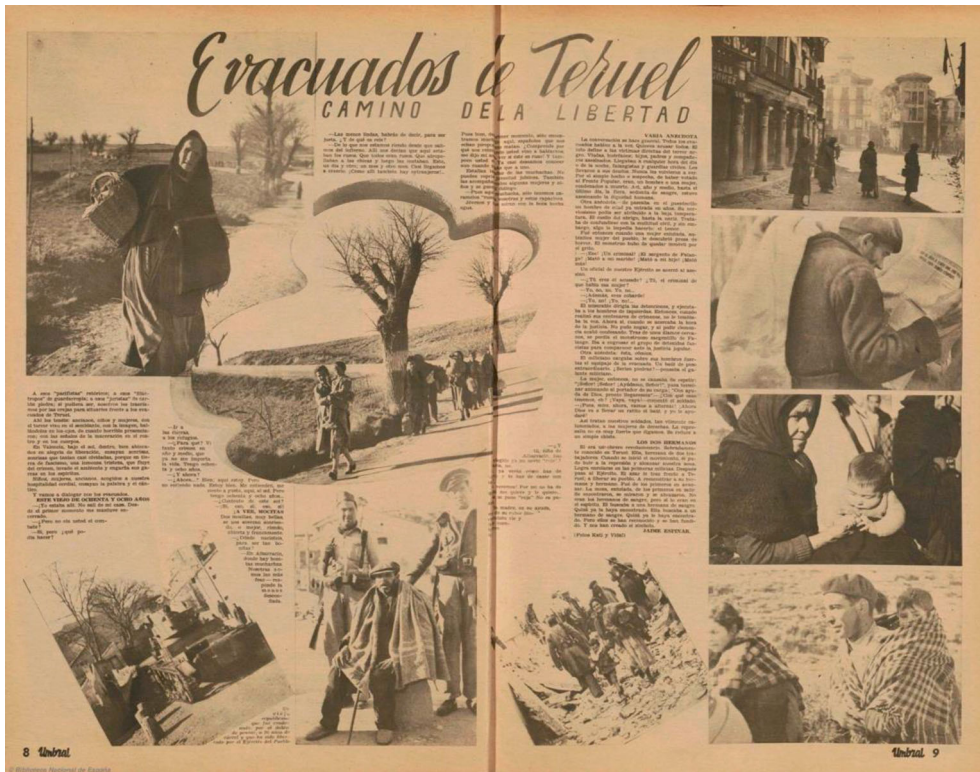
Figure 6. Photographs by Kati Horna, published in Umbral , 8 January 1938, Biblioteca Nacional de España.

captured by the road and in the emotional and material burdens they bear. The road is a fundamental aesthetic and narrative element. The photographs do not look back toward the city that has been abandoned but ahead at an indefinite horizon situated at the edge of the photographic field of vision. The road is a liminal intermediary space but also a contradictory one – open and exposed, but the only path to salvation (Pelizzon 2014, 201). The road also features in Capa’s photographs of the Teruel evacuation, which were published in multiple foreign magazines (see Figure 7). Although Capa’s compositions do not carry the same poetic weight as Horna’s, they too situate el camino as an important visual trope in depicting the experience of displacement.