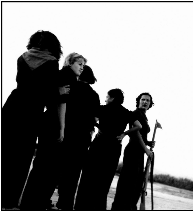
Figure 2. Gerda Taro, Republican Militia Women Training on the Beach, outside Barcelona , International Center of Photography / Magnum, 1936.

The existence of these two dominant imaginaries (Figures 2 and 3), the woman who fights and the mother who resists, gave rise to some of the most fundamental images,