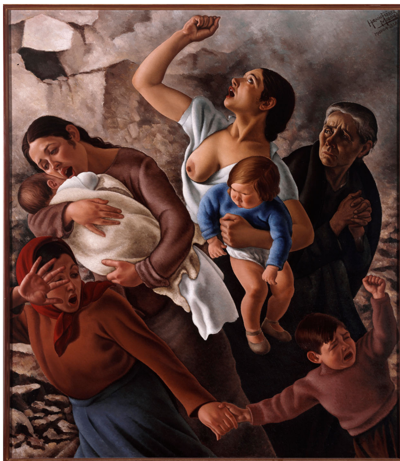
Figure 3. Horacio Ferrer, Madrid 1937 (Aviones negros) , Museo Nacional Centro de Arte Reina Sofía and heirs of Horacio Ferrer, 1937.

indeed icons, of the Spanish Civil War. 5 In literature on the subject, they are often interpreted as two sides of the same coin (Nash 1999). The miliciana is understood as a potent symbol, and in fact a historical reality, linked to ideas of emancipation, modernity and political engagement. She is a figure that accentuates the radicalness of the Republican project that sought to destabilize the patriarchal order of things. In contrast, the combative mother is interpreted as a product of retreat, a move back to conservative values, indeed to a moral economy that situates women and their domestic role in an apolitical private sphere. In this construction, it is the figure of the mother, not that of the miliciana , that is linked to a humanitarian impulse that seeks to make visible the violence of war and the havoc it provokes (García López 2016). Images of suffering mothers and their children – often described as “docile”, “powerless” “victims” – were circulated in illustrated magazines in order to evoke an emotional, supposedly de-ideologized response to the horrors of war (Brothers 1997, 143). In the following section we will dispute the notion that such images of suffering mothers are depoliticized.