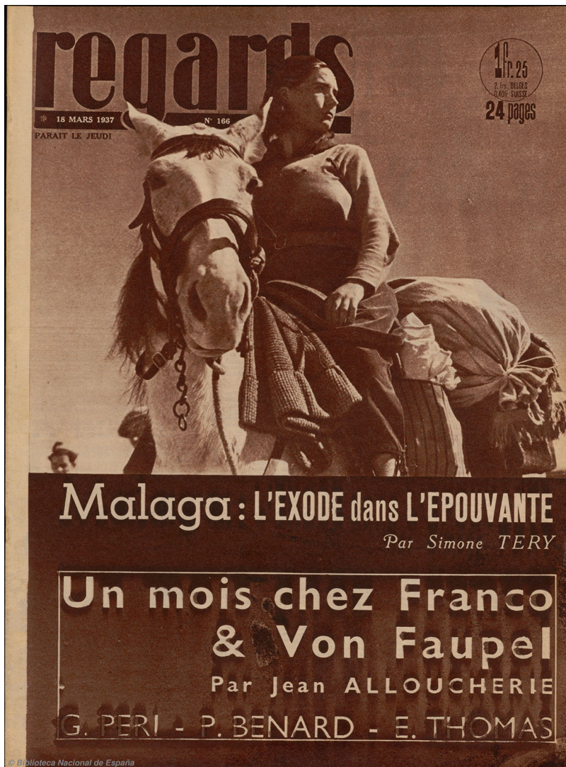
Figure 4. Photograph by Gerda Taro and Robert Capa. Cover of Regards , 18 March 1937, Biblioteca Nacional de España.

precious thing is, indeed, life. This sensitivity to lives sustained and the attention paid to the value of human life give structure to the entire photo essay, which documents the wartime displacement of men and women of all ages, together with children.