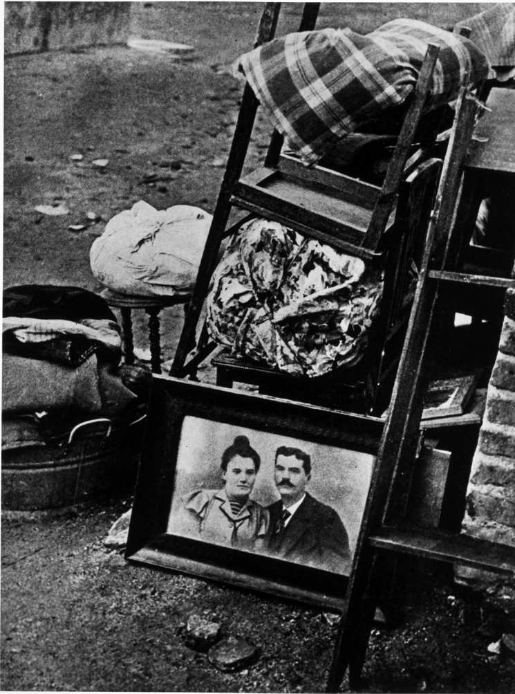
Figure 12. Gerda Taro and Robert Capa, Madrid, Winter 1936–1937 , Museo Nacional Centro de Arte Reina Sofía, 1936–1937, International Center of Photography / Magnum.