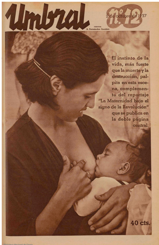
Figure 9. Photograph by Kati Horna. Cover of Umbral , 2 October 1937, Biblioteca Nacional de España.

displacement taps into worlds of emotion in an attempt to mobilize a reaction, to incite a response. If up-closeness came to characterize the war photographer's trade, it was not only because it enhanced veracity, but also because it allowed for a particular kind of photographic practice that captured the intimacy of social life. In this sense, the humanitarian photographic practices deployed by Spanish Civil War photographers were mechanisms that mobilized, shared and made visible a certain ideological and moral framework. Documenting displacement – photographing female bodies, the things they carried, the lives they sustained – was a strategy that sought to activate empathy, aid and resistance for political ends.