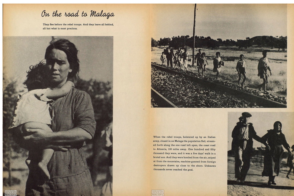
Figure 5. Photographs by Gerda Taro and Robert Capa, published in Death in the Making (New York: Civici-Friede), Museo Nacional Centro de Arte Reina Sofía, International Center of Photography / ICP.

temperatures. By the end of February, the city was taken by Nationalist troops in a major turning point in the war (Graham 2018, 131). In the photographs of the Teruel evacuation, civilian subjects – particularly children, women and the elderly population – play a key narrative role. They make visible the disrupted everyday lives that they are forced to take to the road. This focus on the fleeing subject draws viewers' attention to the fact that the civilian population had become an increasingly common target of mechanized violence. According to Rafael Tranche and Beatriz de las Heras, the systematic appearance of women, children and the elderly in photo reportage of the time was due, in part, to its novelty as graphic news. Photographs of civilian subjects were also more emotionally arresting, more visually compelling than portraits of soldiers at the battlefield, which had become an exhausted visual trope in representations of the war (Tranche and De las Heras 2016, 4). In this respect, the production of these images, like all photo reportage, was entangled with emergent ideas about effective wartime propaganda.