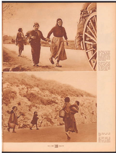
Figure 8. Photographs by Robert Capa, published in Zürcher Illustrierte , 3 February 1939, International Center of Photography / Magnum.

Civil War. However, unlike the photographs previously described, they were not circulated at the time. They remained hidden under the artist's mattress until the end of the dictatorship. Women appear frequently in these drawings. In each one, the female body carries, transports and sustains different things: babies, bags, sacks, household goods, even a