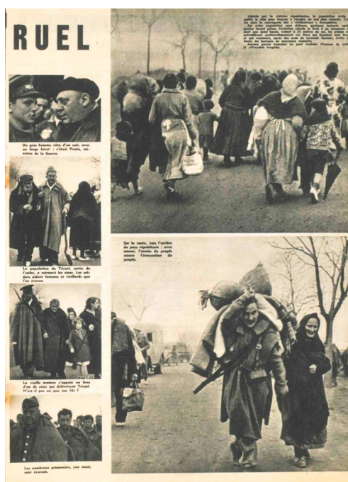
Figure 7. Photographs by Robert Capa, published in Regards , 13 January 1938, International Center of Photography / Magnum.

By January 1939, as the Nationalist siege of Catalonia heightened, thousands of soldiers and civilians fled north from Tarragona and Barcelona bound for the French border. Robert Capa and fellow photographer David “Chim” Seymour documented the mass exodus. The resulting series establishes a cohesive narrative marked by variants: