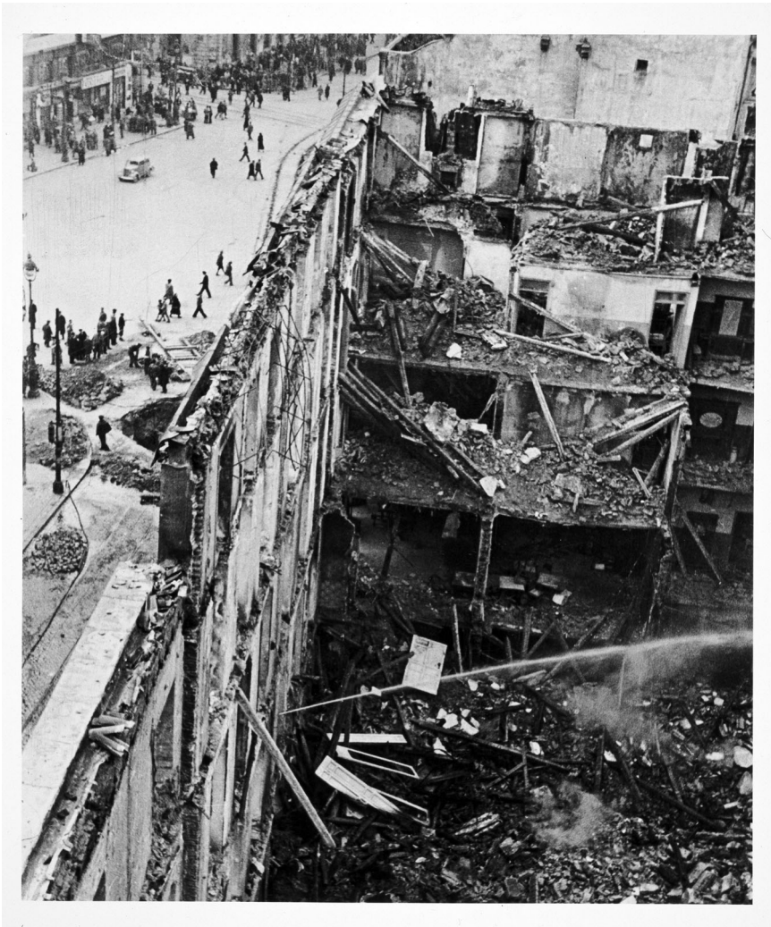
Figure 10. Gerda Taro and Robert Capa, Madrid, Winter 1936–1937 , Museo Nacional Centro de Arte Reina Sofia, 1936–1937, International Center of Photography / Magnum.

spread of fascism produced human suffering on a massive scale. Such manipulation should not be seen as lessening the images' truth-value.