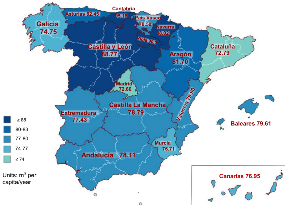
Fig. 1 Rate of per capita water use at the regional level.

economic growth, social stability, and environmental sustainability (Berbel and Esteban 2019; Garrick et al. 2020). The inefficient utilization of resources – particularly water itself – further exacerbates issues of scarcity, while a transition to more efficient practices can help alleviate this problem.