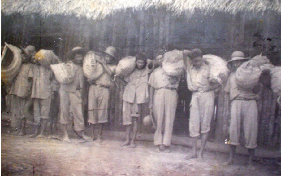
FIGURE 6 First Harvest at Casarabe