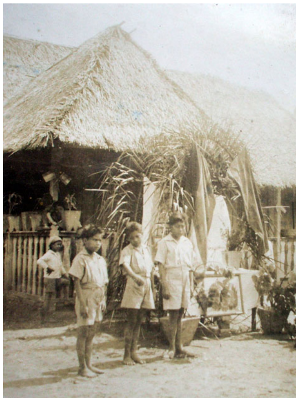
FIGURE 7 Sirionó Children in Front of the Altar to the Nation