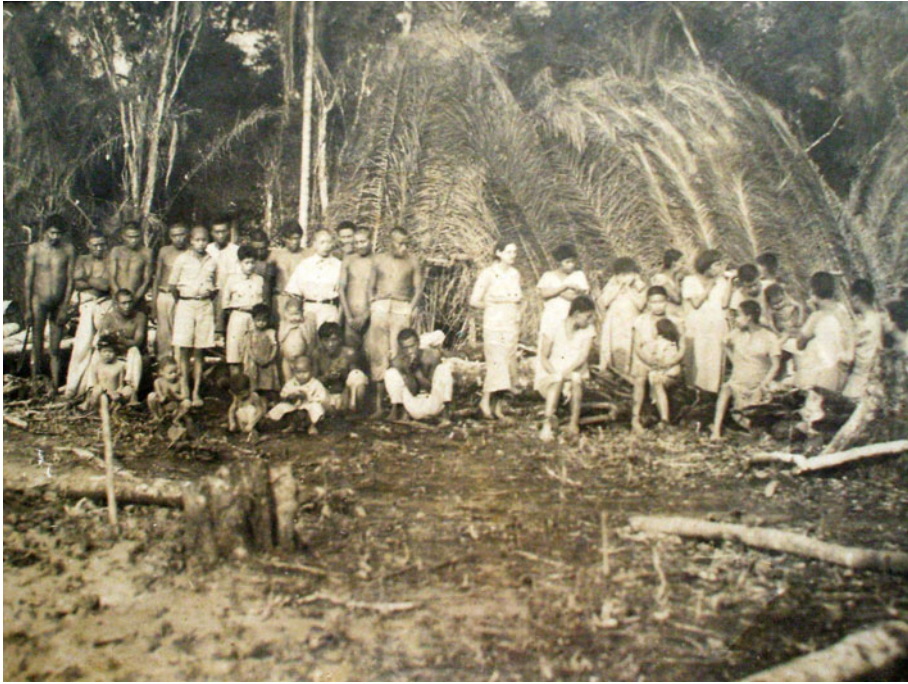
FIGURE 2 Founders of Casarabe