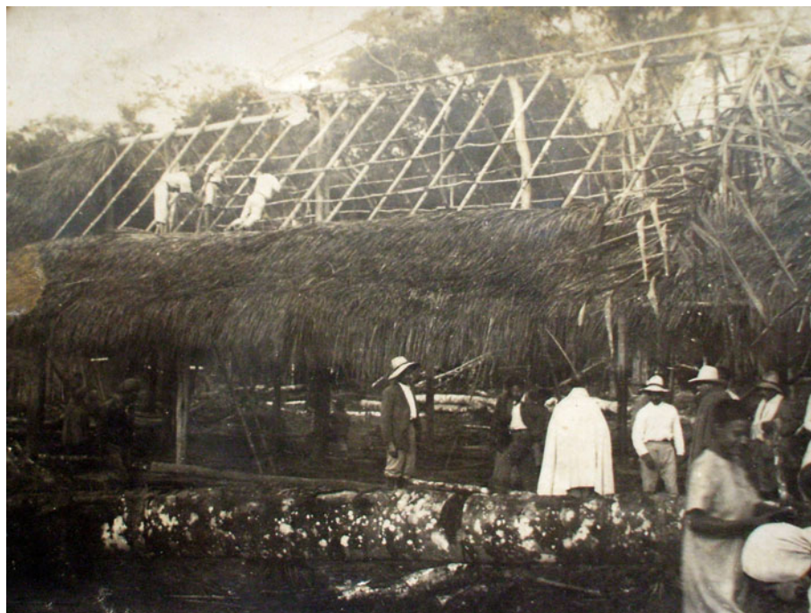
FIGURE 3 Constructing the School Building at Casarabe