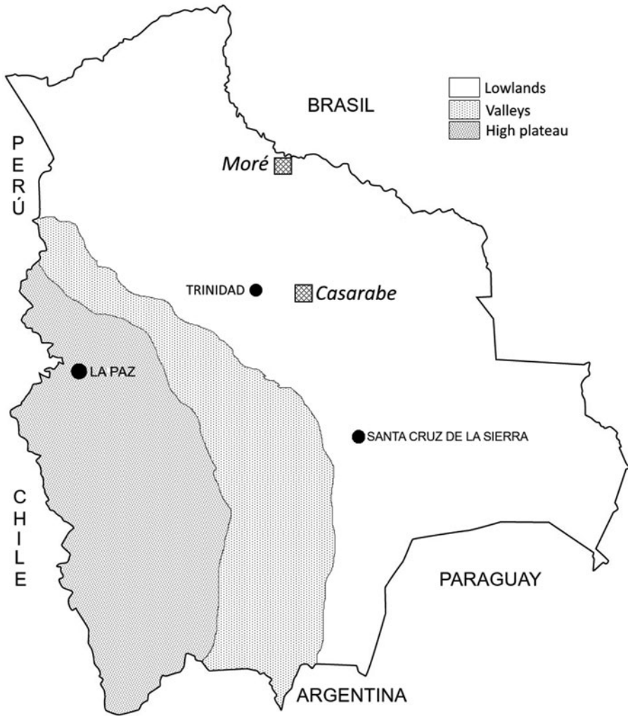
FIGURE 1 Locations of Casarabe and Moré