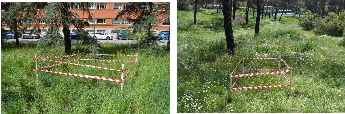
Figure 1. Some examples of marked-out orchid plots.

To achieve this goal, for the last four years (2022-2025) we have carried out random routes through the Campus greenspaces from late February to late April, the optimum growth period for this plant. Each individual found was georeferenced and its phenology and habitat were recorded. When possible, the plots were marked out by wooden stakes and marking tape (Figure 1).