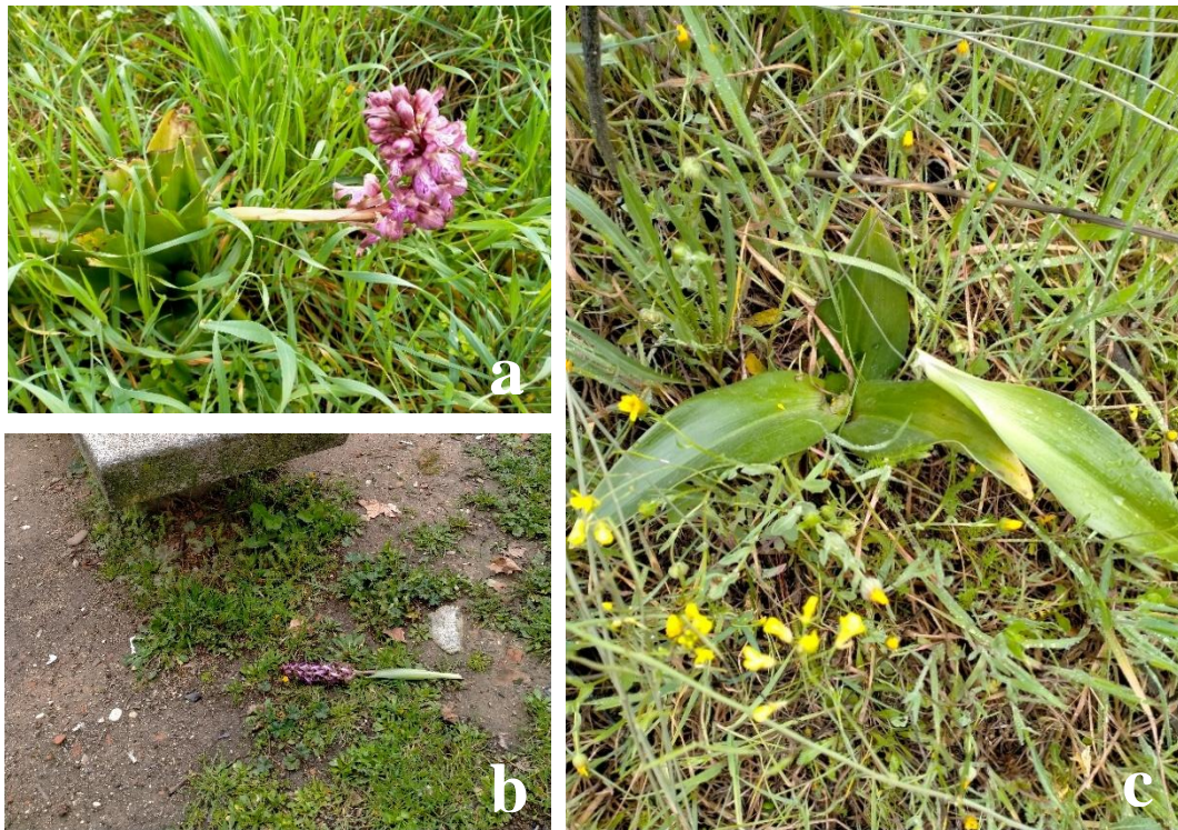
Figure 3. Examples of individuals affected by trampling (a) and harvesting (b,c).