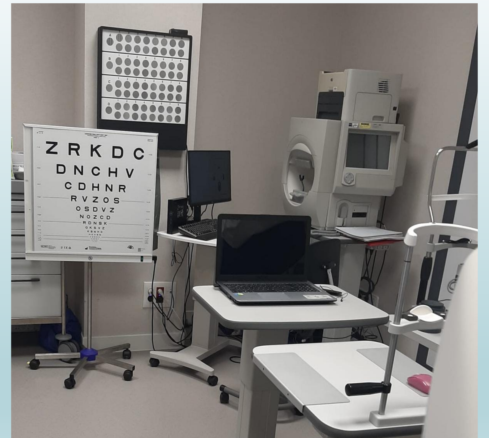
Figura 2: Room and material used in the study