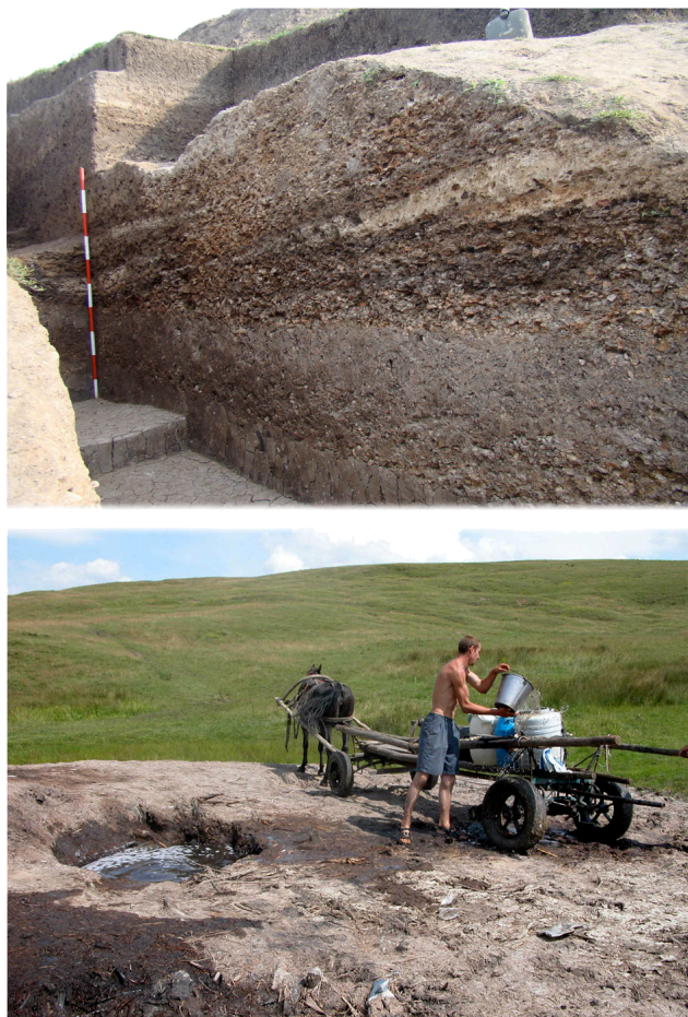
Figure 4. Hălăbutoaia–Țolici (Neamț County). Prehistoric and present exploitation of the salt spring.

What differentiates Romanian salt springs from those found in more famous areas of Europe (especially France and Germany) is the continuity of exploitation and use of natural brine even in present times (Alexianu et al. 1992; 2007) (Figure 5). This unique opportunity in Europe was capitalised by the two already-mentioned ethnoarchaeological research projects financed by the Romanian Government. The research conducted in the framework of these two projects followed two main directions: the identification of the salt springs and salt mountains/cliffs and the adjacent archaeological vestiges, and the ethnological investigations through spatial analysis. As we did not commence with preconceived ideas, realities on the field forced us to address quite diverse topics (the only ones mentioned here being the ones related strictly to the salt springs).