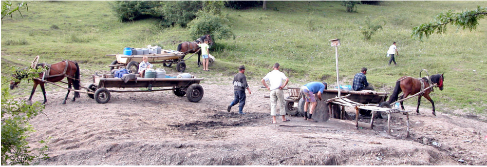
Figure 5. Present-day exploitation at Lunca–Poiana Slatinei.

Thus, much needed attention was given to abandoned salt springs. We defined a typology of salt-spring catchment systems, we performed a classification of settlements that use salt springs, we analysed the means of transport of natural brine, we identified the spatial-temporal strategies for producing recrystallized salt (Rmn. huscă ), and studied the transmission of knowledge from one generation to another. In terms of current use of natural brine from salt springs we studied human nutrition, food conservation, animal nutrition, traditional human salt therapy, craft uses, hunting and salt spring related hunting, the symbolic use of salt, exchange, sale, gift, etc. (Alexianu, Weller and Brigand, 2007).