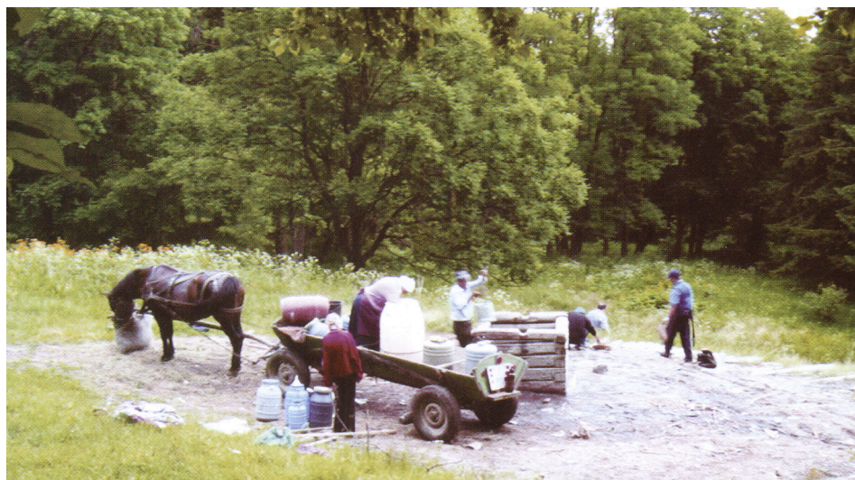
Figure 2. Brine collecting at the Solca- Slatina Mare salt spring.

The first archaeological survey in the vicinity of a salt spring was conducted in 1968. The publication and interpretation of the ceramic artefacts, on the other hand, only occurred after nearly a decade, and was carried out by a prehistoric archaeologist (Ursulescu 1977). The ceramic remains discovered in the surrounding area of this salt spring, called Slatina Mare, situated in the village of Solca (Figure 2), Suceava County, were attributed to an entire series of archaeological cultures and eras, from Starčevo-Criș, to Precucuteni, Cucuteni-phase B, the first Iron Age and the Early Modern Period. Ursulescu was the first Romanian specialist to identify in some ceramic fragments the briquetage used for the recrystallization of salt from brine. Another survey conducted in 2003 confirmed the prehistoric use of this salt spring only during the Cucuteni period (from which a large amount of briquetage were found) and the Bronze Age (Nicola et al. 2007). What seemed to be an isolated finding gave way to an entire series of salt spring for which exploitation during the archaeological time has been scientifically confirmed.