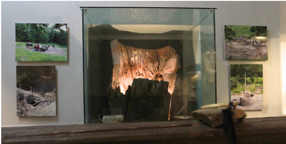
Figure 6. Display case with the buduroi from Țolici–Hălăbutoaia in the permanent exhibition of the Piatra Neamț County Museum.

In general, the same exhibition principles were followed as in the similar section in the Piatra Neamț Museum. In this case too, it should be mentioned that the exhibition does not display the original buduroi from Poiana Slatinei, where the exploitation of the salt spring by the rural communities continues to this day. The buduroi displayed in the permanent exhibition at the Târgu Neamț Museum came from Oglinzi-Slătior, a less important salt spring from the area.