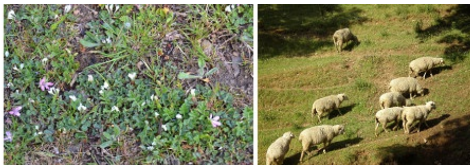
Figure 3. Poetea bulbosae grassland used for sheep grazing (pastures located in Sierra Morena, province of Ciudad Real).

Subnitrophilic–nitrophilic grasslands have a high ecosystemic value; however, they are rarely used or not used by the population, possibly due to a lack of knowledge or because communities have been taught that they are weeds. This has led to the use of herbicides in agriculture, and the application of inadequate cultivation techniques that damage the flora. However, there are studies on bioindicators of nutrients in the soil, which should guide the sustainable management of these grasslands [42–44].