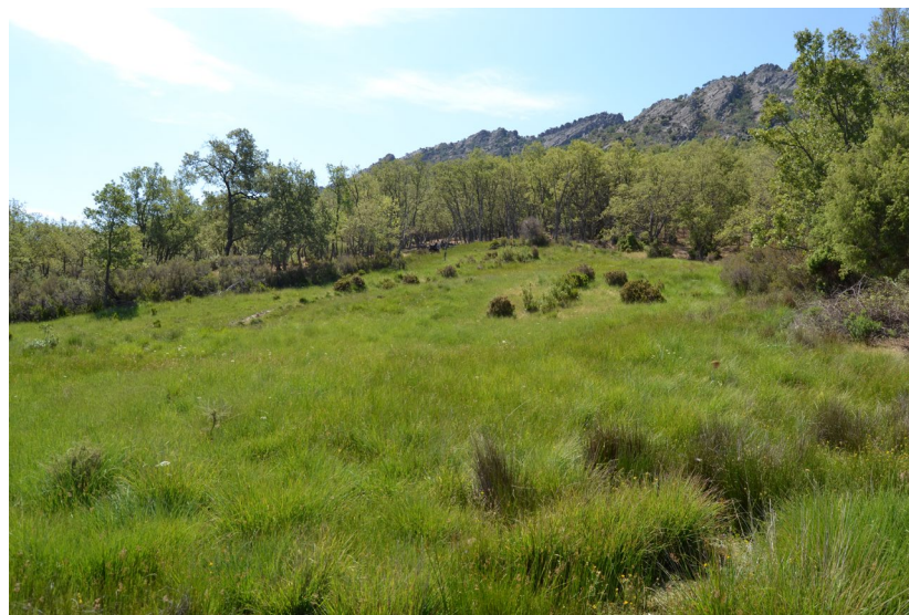
Figure 1. Grasslands–juncals of Molinio-Arrhenatheretea (habitat located in Sierra Morena, Andalusia).

The grassland–herbaceous–juncals ( Molinio-Arrhenatheretea ) of humid and waterlogged areas are very frequent in temperate climates, and in the Mediterranean they represent wetlands of interest for livestock farming; these are communities of high floristic diversity, which has led to the differentiation of up to 119 associations or plant communities. The pastoral value of temperate communities is high, and they help to maintain an important livestock population in Europe. In Mediterranean areas, these communities have less value but are important due to their use for nesting birds. Therefore, Mediterranean wetlands are protected by the EU and by the laws of different countries (Figure 1).